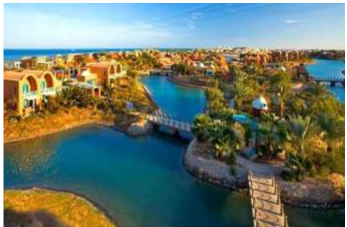
Sheraton Miramar Gouna