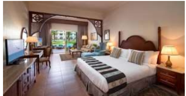
Baron Sahl Hasheesh