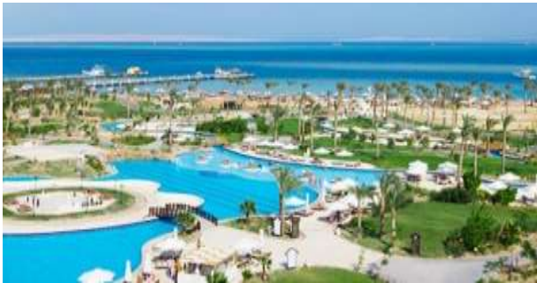
Steigenberger Al Dau Hurghada

From April 18 th till April 22 nd , 2019 (5D/4N) From April 18 th till April 25 th , 2019 (8D/7N)