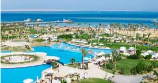
Steigenberger Al Dau Hurghada

From April 29 th till May 02 nd , 2019 (4D/3N)