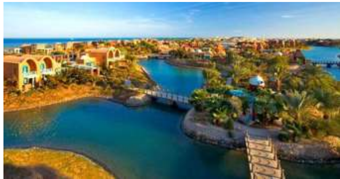
Sheraton Miramar Gouna