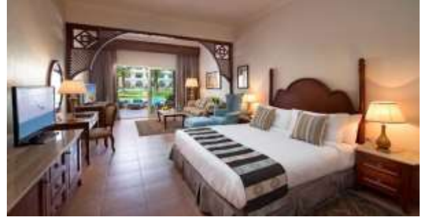
Baron Sahl Hasheesh